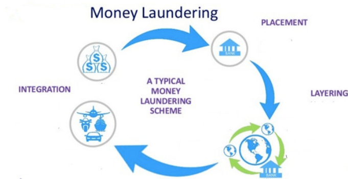
Figure 3. Specific measures to strengthen anti-money laundering compliance management in Southeast Asia

platform, while Bitcoin provides an anonymous way of asset flow, and greedy desire increases. Going outside the law makes it difficult to remove money laundering.