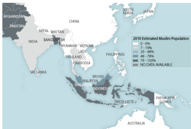
Figure 1. Analysis of Proportion of Money Laundering Channels in Southeast Asia

Electronic payment as a popular payment method. With the globalization of the economy, more and more tourists, students, and workers use international bank credit cards, UnionPay Visa credit cards, and wire transfer agents for overseas consumption, entertainment, and shopping opportunity. For example, a money launderer may advance cash from credit cards of multiple accounts with unknown directions, and put the proposed funds in a bank account of an international bank or other country that is used to receive the transfer, so that the bank will automatically debit the main account. Funds are repaid to credit cards, and funds for illegal transactions are included in the financial system. Due to international banks and transnational reasons, it is difficult to monitor the true source and destination of funds. Later, money launderers used the stolen funds to buy goods in major malls and sell them to provide cash to criminals. Cross-border wire transfers are wire transfers where the remittance bank and the beneficiary bank are located in different countries. It is difficult for the remittance bank, transit bank, and beneficiary system in the bill of a country to obtain the real information of the sender and the real purpose of the remittance from the cross-border wire transfer.